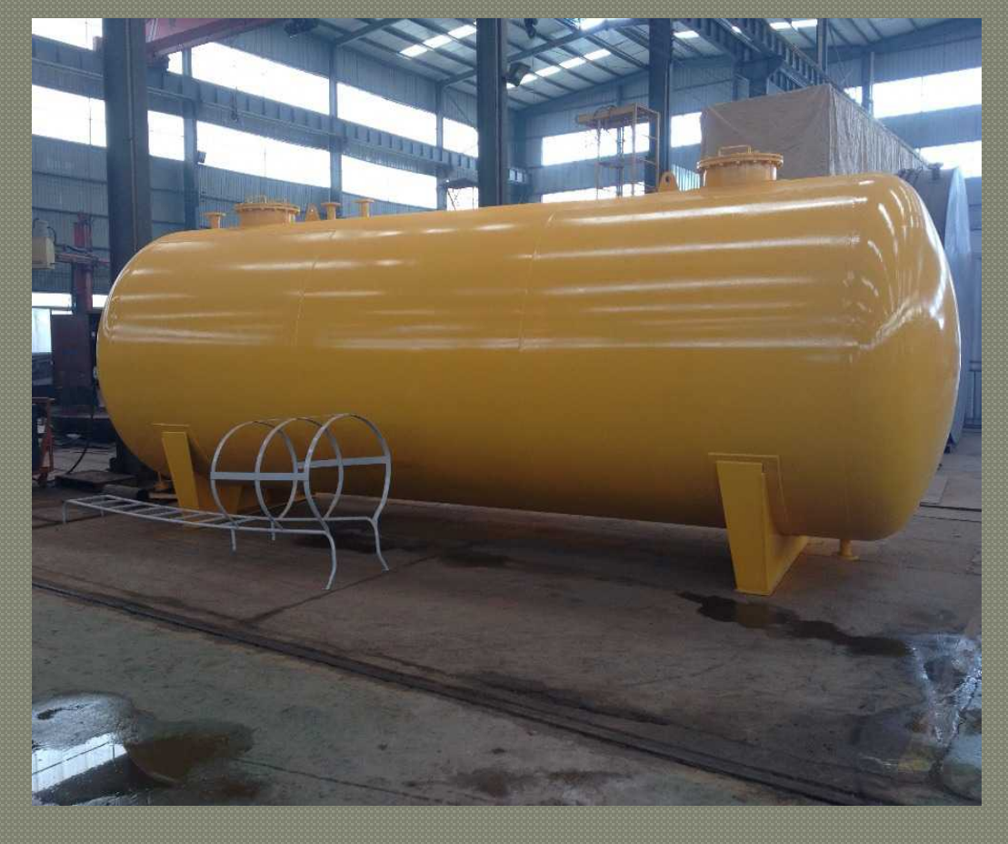
Cylindrical Tank for Caterpillar generator